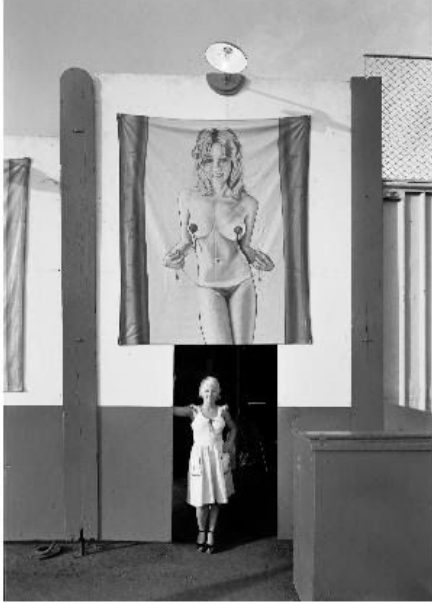
403-2041 Carnie Stripper 1970s Silver gelatin print 25 x 21 in $3,500.00