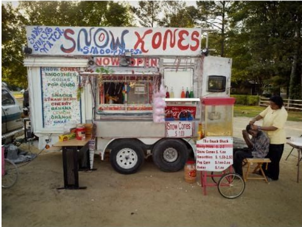
403-2050 Snow Kones Inkjet print Ed. AP 4/5 24 x 32 in $5,000.00