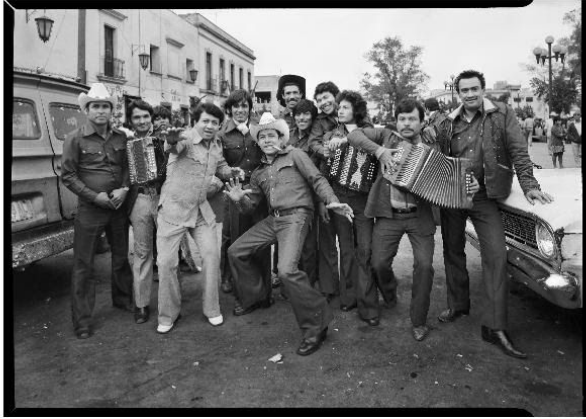
403-2052 Banda del Norte 1975 Piezo Inkjet Print Ed. 11/25 24 x 32 in $5,000.00