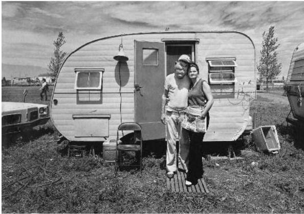
403-2040 Bob and Virginia Melvin 1970s Silver gelatin print 21 x 25 in $3,500.00