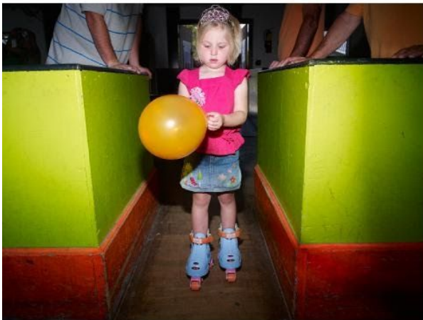
403-2049 Birthday Girl Inkjet print Ed. AP 3/5 24 x 32 in $5,000.00